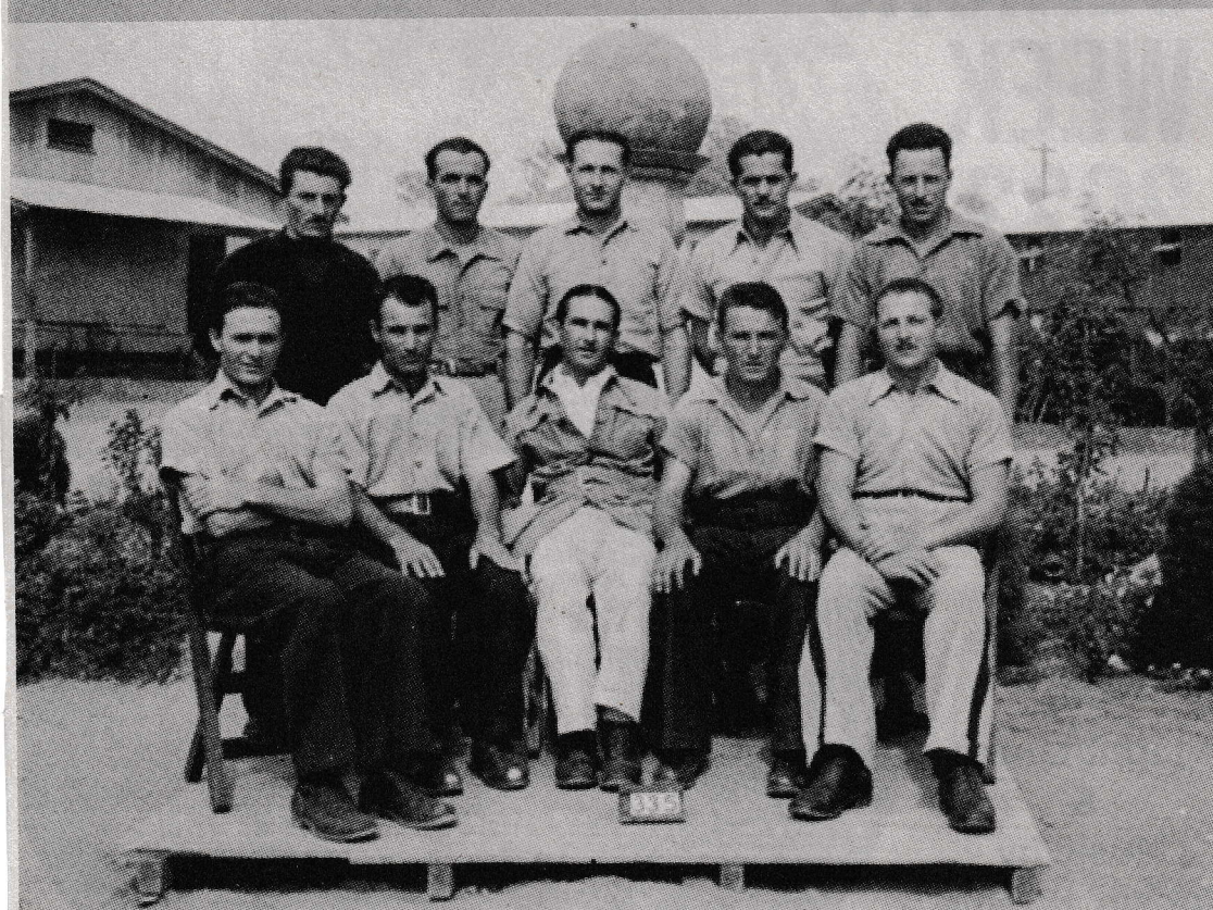
Cowra, NSW. 6 February 1944. Group of Italian prisoners of war (POWs) interned at No. 12 POW Group.